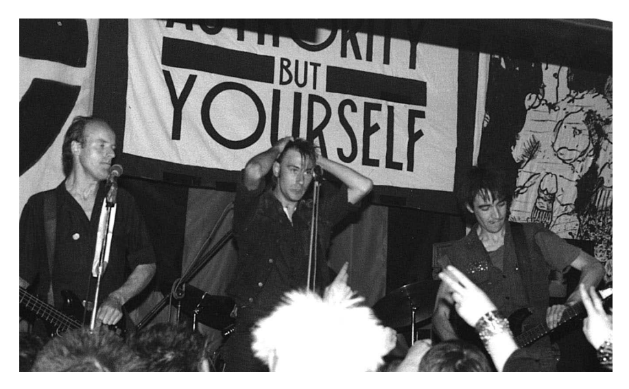
Figure 2. Crass, live 1984. L-R Pete Wright, Steve Ignorant, N.A. Palmer. Black and white, cropped.