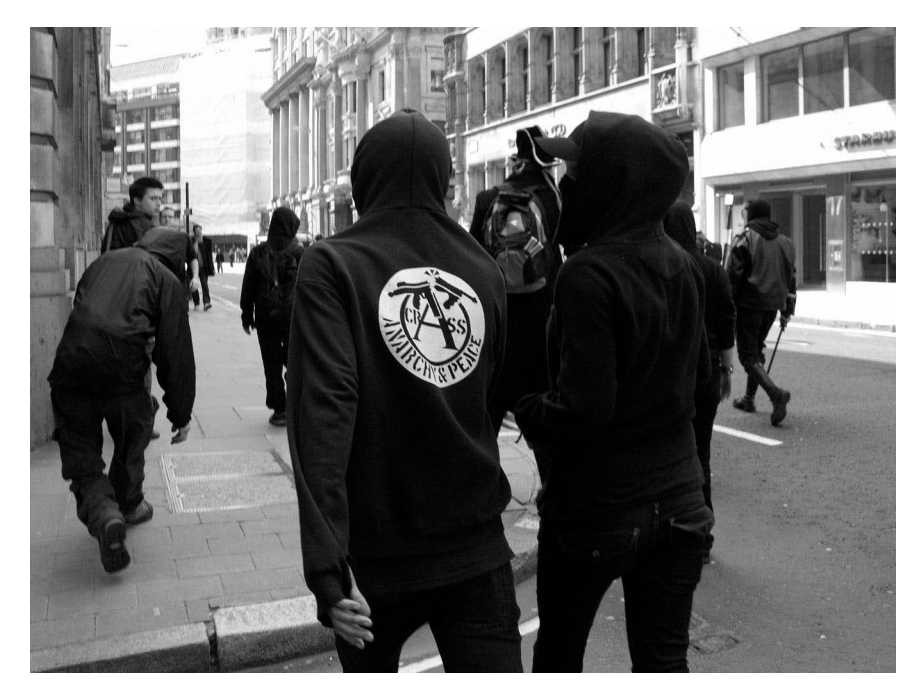
Figure 1. G20 protestors, London 2009: the legacy of the Crass brand in later anti-capitalism.

heart: music recording, production, and distribution, live performance and promotion, recorded sound, film and video experimentation, clothing and style, visual art and design, graffiti and street art, logo design and branding but also subvertising, typography, alternative organization networks, and grassroots touring circuit, lifestyle and domestic arrangements from eating to collective living, fundraising for campaigns, détournements and pranksterism – all of these featured in an ambitious and encompassing extension of DIY practice. Much of this happened from a small group of people living together in a farm on the edge of Epping Forest, Essex, 15 miles from central London. It was a remarkable cottage industry.