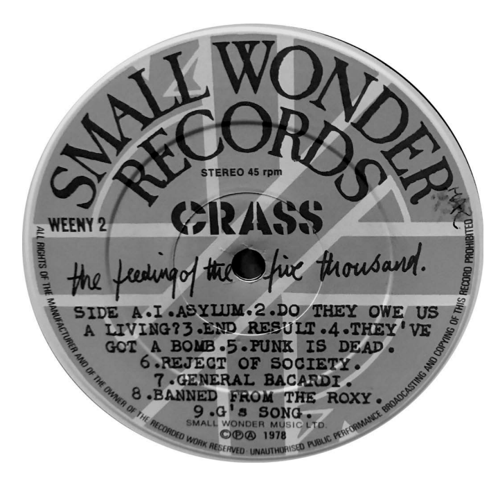
Figure 5. "The music was becoming self-consuming, like the Crass circular tail-eating-head logo" itself (gray background image).