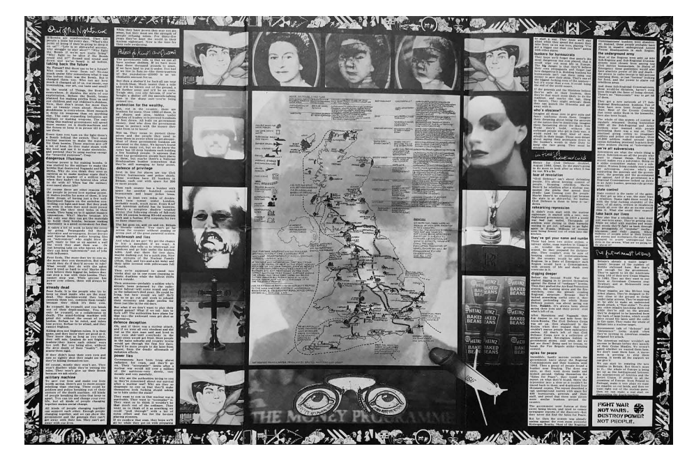
Figure 4. Crass, "Nagasaki Nightmare"/"Big A Little a" single sleeve fold-out poster, 1980: "a tour de force of musical-cultural propaganda".

pervasive nature of nuclear culture, via a punk reference to the Sex Pistols, and tells us something important about what Manabe and Schwartz term nuclear music, too: