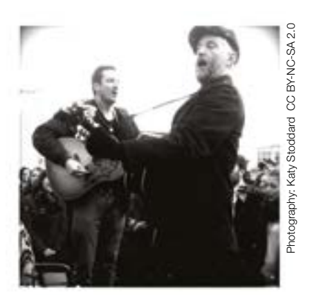
Frank Turner and Billy Bragg busking,

Diverse or unusual instruments are also a feature of street performance. As one London Underground busker from the 1980s put it, 'by playing in public pretty much constantly, I expose many people to instruments they would never otherwise hear. In doing so, I have inspired three people to buy a hurdy gurdy, and