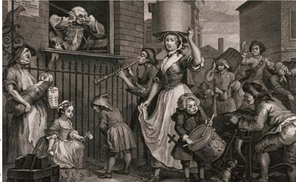
William Hogarth, The Enraged Musician, 1741.

Yet, in the work of 18th century artists such as William Hogarth, street singing is 'described and depicted [as] integral to the life of the city' (Atkinson 2018: 94). Hogarth's The Enraged Musician (1741) depicts a classical violinist practicing indoors and protesting against the noise of a London street populated by the 'unlearned' hoi polloi of ballad singers, street hawkers, and street musicians (Johnson 2017: 69).