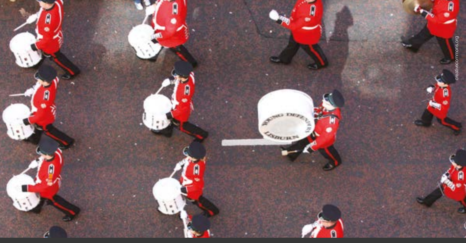
Ulster Covenant Commemoration Parade, Belfast, September 2012

Having championed and opposed bureaucratic restrictions on busking for many years it is hugely encouraging to see this very well researched study which looks at the origins and cultural importance of street music, its benefits and in particular its contribution to societal creativity.