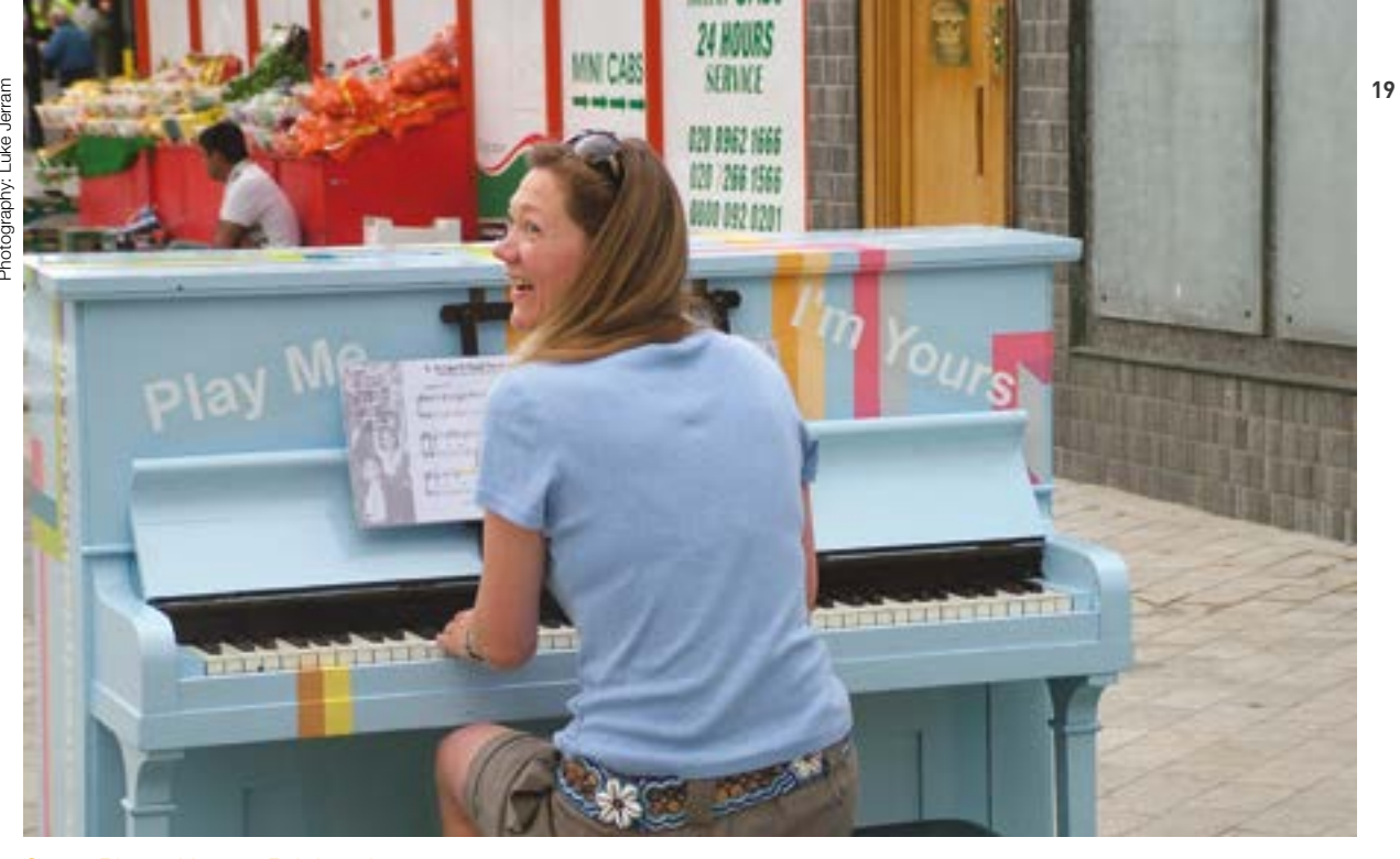
Street Piano, Harrow Rd, London, 2009.

Bennett and Rogers also highlight the performance energy and quality aimed for by street musicians among the hubbub of the street, which they refer to as a 'desire for momentary stasis in performance', and examine how such performatives desires can be realised by technology; how, for example, the 'sound of a performance can be pushed into a specific place and held there with an amplifier' (Bennett and Rogers 2014).